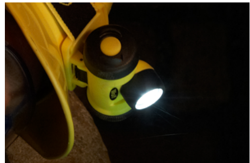
The HT-400Z0 allows hands free illumination