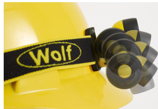
A tilt mechanism allows the beam to be directed where needed